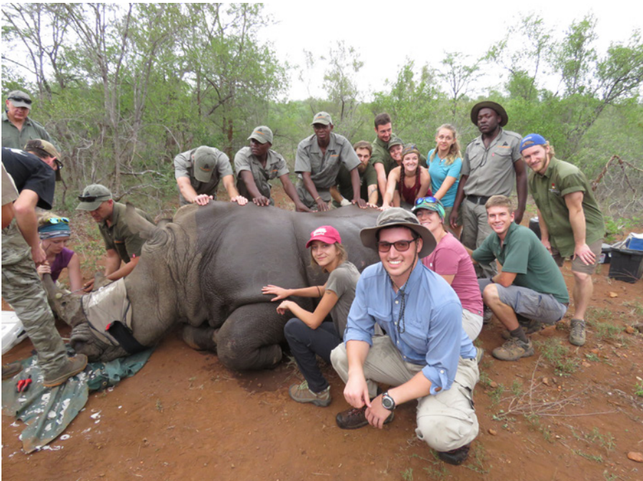
Fleming students assist the veterinarian in assessing the health of a darted rhino.

In the winter of 2018, Fleming College launched its first 12 week semester abroad experience for students at the Askari Wilderness Reserve in South Africa. Our Fleming Flashback contest question is: What academic program is this semester abroad experience a part of?