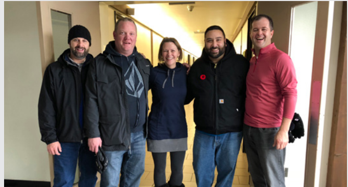
Right top: Alumni Axe Throwing Social